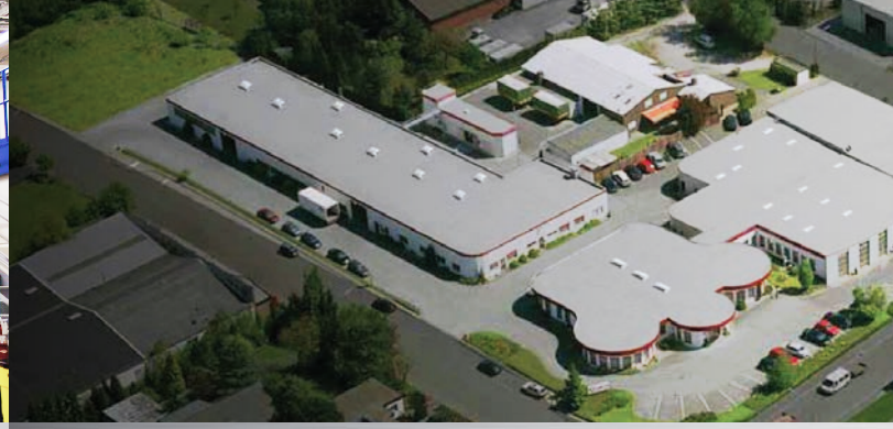
KEMPER SYSTEM GERMANY