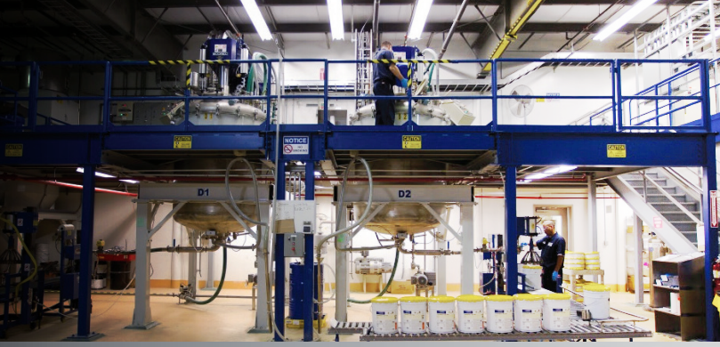
KEMPER SYSTEM AMERICA